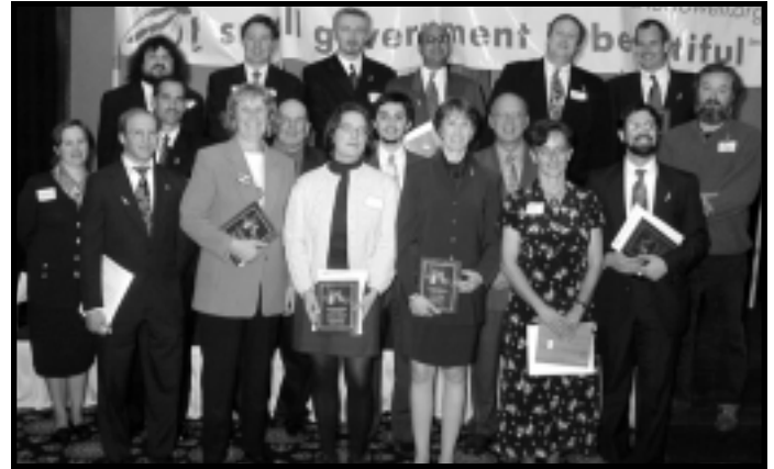
Libertarian candidates were cheered at an election night rally in Dedham.