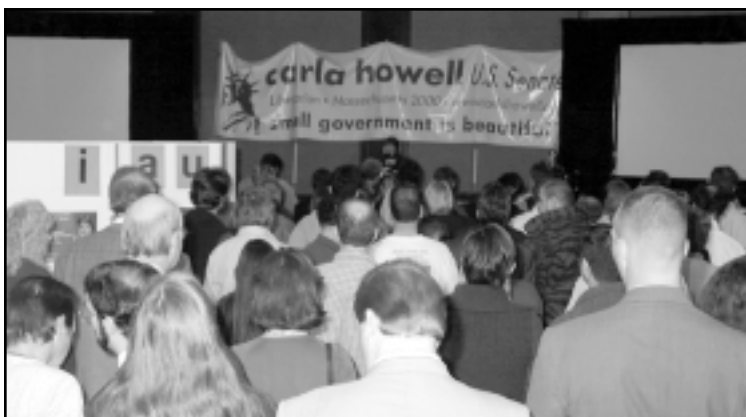
Over 200 Libertarian campaign workers and activists attended the election night celebration at the Dedham Hilton