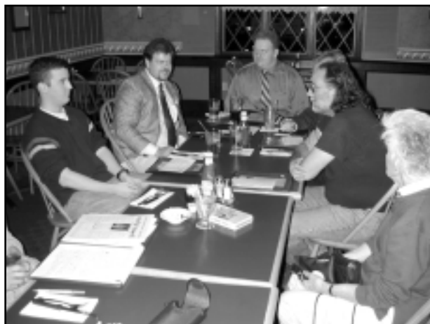
The October meeting of the Worcester County Libertarian Association