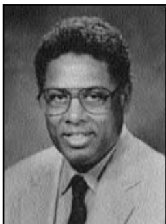
Author Thomas Sowell

This June we celebrate the birthday of Thomas Sowell, who was born on June 30th, 1930. Sowell was born into poverty in the Jim Crow South during the Great Depression, and grew up in Harlem. His incredible life story involves time with the Marines, having a career as a controversial writer, teacher, and economist, and earning a PhD in Economics at the University of Chicago. Sowell is currently a Rose and Milton Friedman Senior Fellow at the Hoover Institution in California.